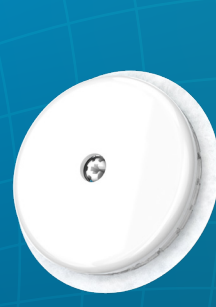
DIABETES CARE FreeStyle® Libre