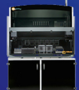
m2000® RealTime System