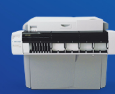
ARCHITECT i1000SR and i2000SR